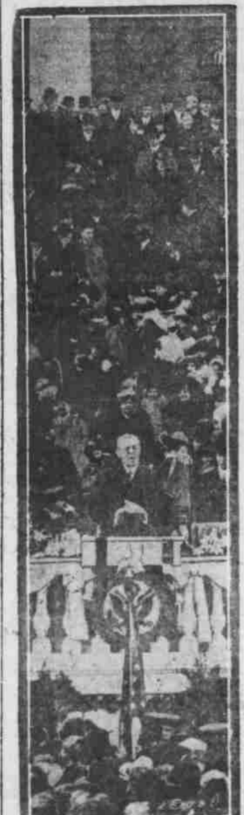
This photograph was taken four years ago when President Wilson delivered his inaugural address from the foot of the main steps of the Capitol. The same kind of stand was built in the same spot and the seats on the Capitol steps were arranged in the same way for yesterday's inauguration.

PRESIDENT DELIVERING INAUGURAL ADDRESS FOUR YEARS AGO