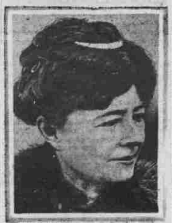
MAYOR LAURA STARCHER.

AMERICA'S ONLY WOMAN MAYOR TO MAKE HER CITY A "SPOTLESS AND POLICELESS" TOWN.