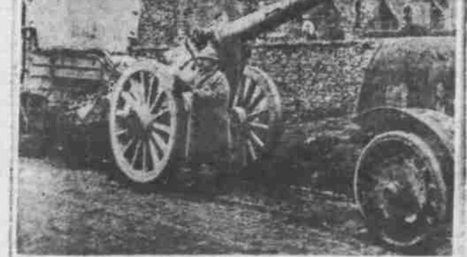
Above is a picture of one of the big French guns that has been booming out its song of death to the Germans who attempted to recapture the ground lost on the Somme.