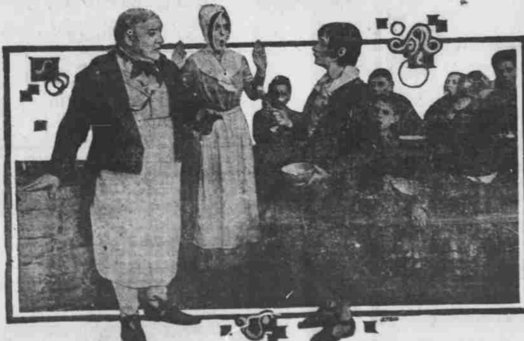
SCENE FROM "OLIVER TWIST," A PARAMOUNT PICTURE PRODUCED BY LASKY.

This is an exact reproduction of one of the celebrated George Cruikshank's original sketches for the first edition of Charles Dickens' immortal story, "Oliver Twist." It is a scene from the Lasky adaptation of the story for the Paramount Program in which Marie Doro stars in the role of Oliver. Immediately upon "asking for more" Oliver is thrust into solitary confinement, like a criminal, by the poorhouse authorities. This is one of the drawings which formed the center of the great Dickens-Cruikshank controversy when the gifted caricaturist claimed that it was really his illustrating of the first "Oliver Twist" stories which led the novelist to expand the tale to its present form. This is one of the scenes which was literally taken from the book by the Lasky Company.