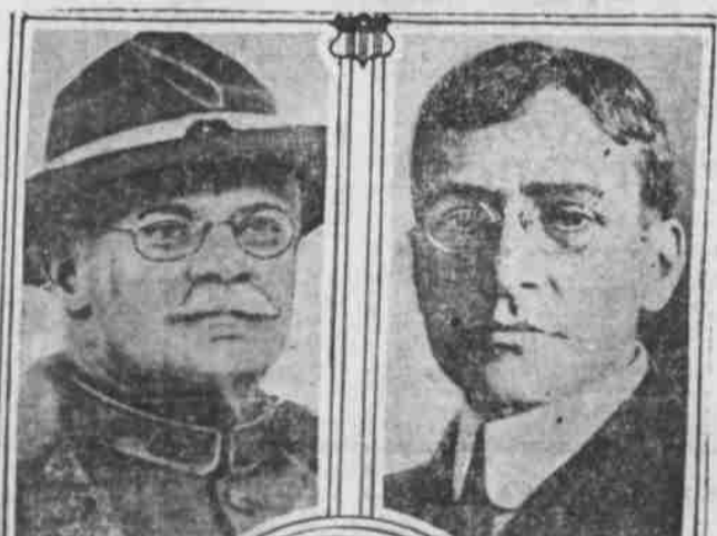
MAJ-GEN. HUGH L. SCOTT. SECRETARY OF WAR BAKER. BRIG-GEN. TASKER H. BLISS.

These are the men who will command the military situation in the event of a declaration of war between the United States and Germany, while the president is the commander-in-chief of both the army and the navy, the direct command would fall to Secretary of War Newton D. Baker. Next in authority to Secretary Baker would be Major General Hugh L. Scott, chief of the general staff, which organization is expected to devise all of the strategic moves of the army and to plan the campaign generally. Major-General Tasker H. Bliss is assistant to General Baker.