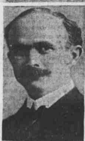
JUDGE BEN W. LINDSAY.

DENVER, Feb. 17.—Judge Ben Lindsay, who has gained nation-wide prominence for his work in the juvenile court here and his lectures on the proper methods to use in attempting to save the so-called "bad boys" of