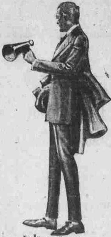
THE SYSTEM CLOTHES

We now have in stock the snappiest lot of young Men's Suits ranging in size from 34 to 40, ever shown in Pendleton. The new double breasted pinch backs are probably the most noticeable. Soft materials are logically the ones best suited to these new models, and our stock is full of them. Give yourself just a shade the best of it and come and look these suits over before you buy. If you don't you'll be sorry later when you see the other young fellows on the street dressed and looking so attractive with T. P. W. suits. Priced from $20.00 to $25.00.