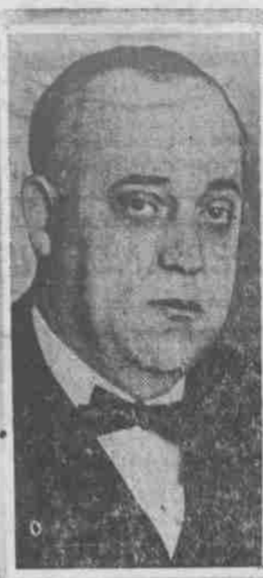
GOV. A. O. STANLEY