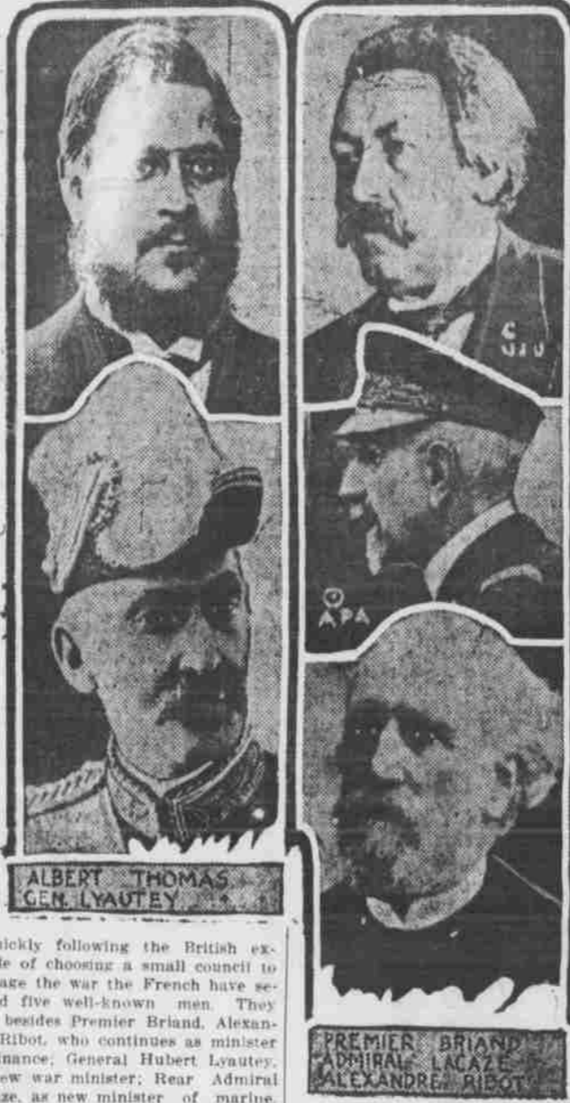
ALBERT THOMAS GEN. LYAUTEY