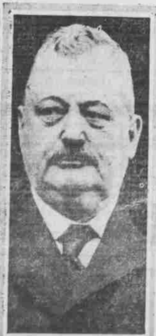
SEN. BOIES PENROSE.

Boies Penrose, United States senator from Pennsylvania, who is conducting the fight in congress for the "force bill" which he introduced, designed to give the control of national elections into the hands of the federal government.