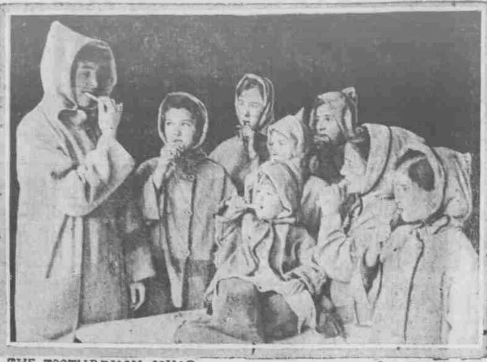
THE TOOTHBRUSH SQUAD.

Chicago has just finished celebrating dental week. One of the features of the week devoted to the instruction of mouth hygiene was classes in "tooth-brushing" held at the public schools. The photograph shows children of the Franklin open air school being taught how to clean their teeth.