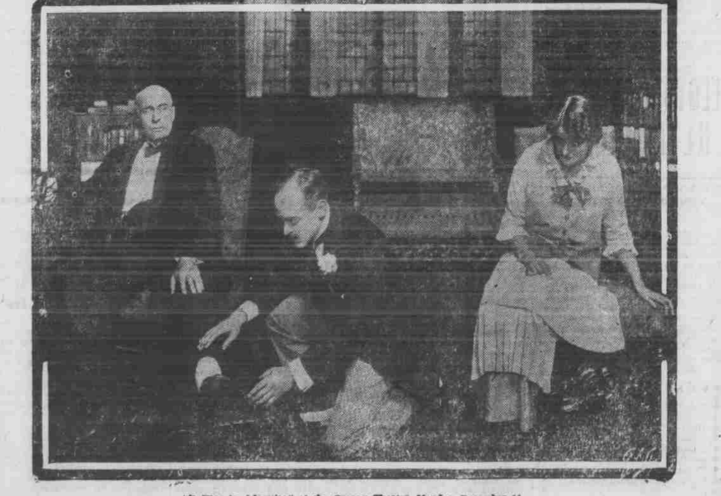
"It Pays to Advertise," at the Oregon Theater, Monday, December 11.