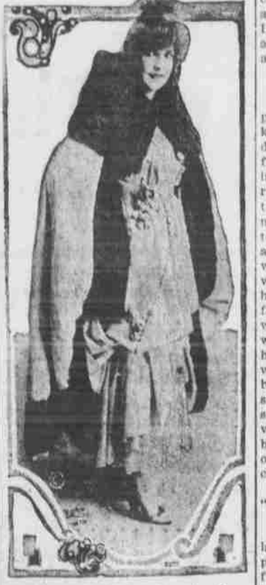
Fannie Ward, Lasky Star, in Paramount Pictures. The latest fashion design to come from Fannie Ward is herewith pictured. It is beautiful even when worn by a lesser star than herself and bids fair to be one of the cloaks talked about this season.