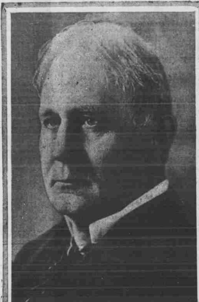
SPEAKER CLARK

When Speaker Champ Clark opened the short session of the Sixth-fourth congress today it may mark his last session as presiding officer of the house. Lines will be so close