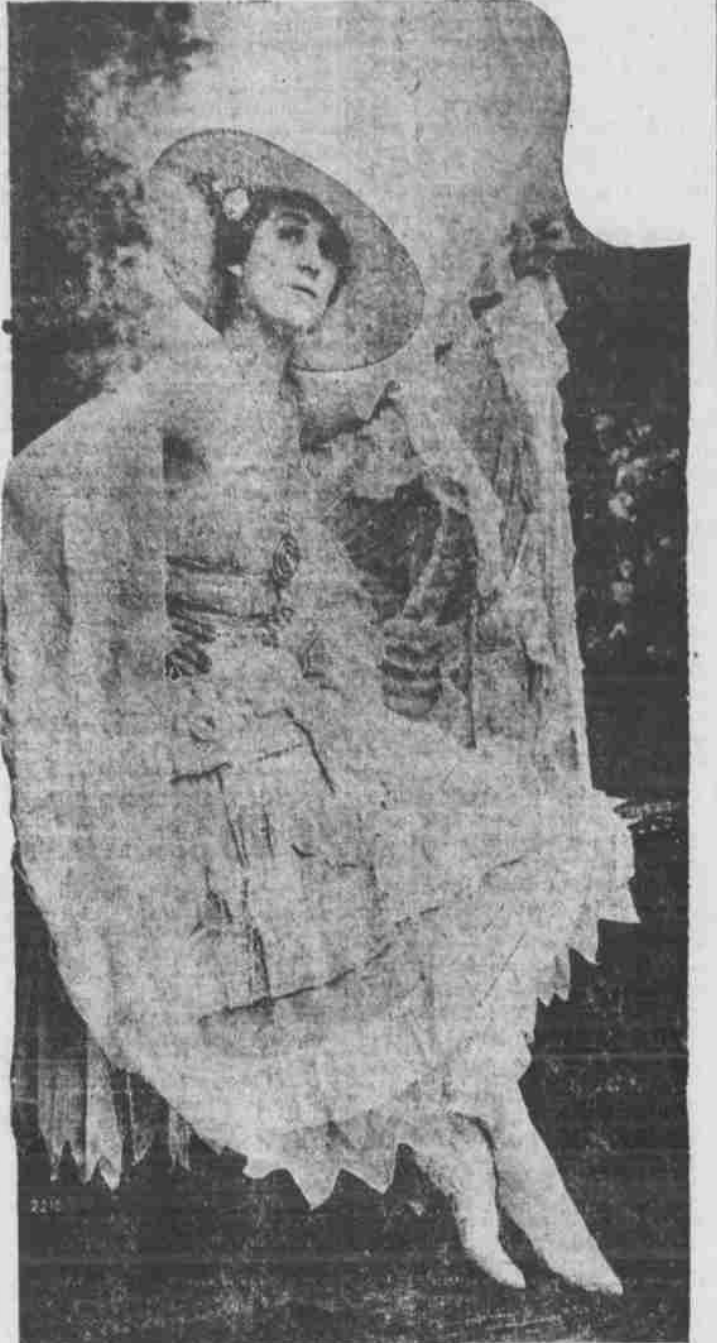
FLORENCIA WALTON, FAMOUS PLAYERS STAR IN PARAMOUNT PICTURES.

Flesh marquisette dresses trimmed with ecru lace and pastel sequin. This has a very low, tight fitting bodice. The hat is in brilliant yellow silk trimmed with handmade flowers in citron and emerald green. Colors at the belt are in shades of mauve, blue and pink.