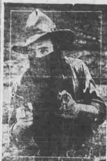
Douglas Fairbanks in new Triangle-Fine Arts Feature, "Manhattan Madness."

ache and feel all worn out. Are you trenches northeast of Courcellette, prepared put the sugar and water in-trenches northeast of Courcellette, prepared put the sugar and water in-trenches northeast of Courcellette, prepared put the sugar and water in-trenches northeast of prepared put the sugar and water in-