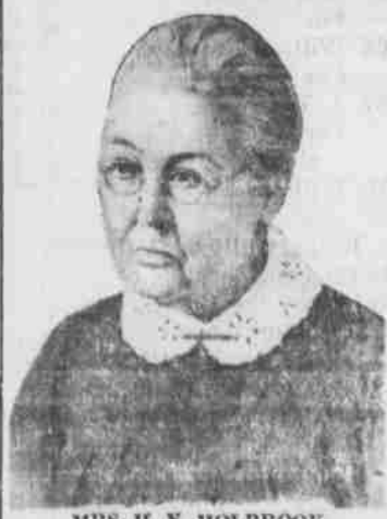
FEELS TEN YEARS YOUNGER NOW AND ENJOYS THE BEST OF HEALTH.