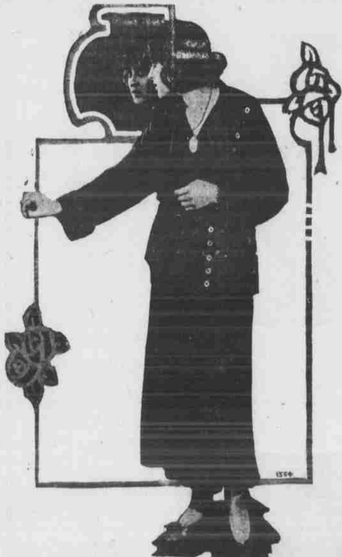
LENORE ULRICH, MOROSCO-PALLAS STAR IN PARAMOUNT PICTURES.

Being double-faced and two-faced are two entirely different things. Hers with is presented what one could naturally term "double-faced-Lenore-Ulrich, the snap having been taken in her beautiful apartment in an exclusive New York Hotel. No one in the world with eyes like hers, even though photographed in a "double-faced" pose by the aid of a mirror, could ever be called "two-faced. Miss Ulrich's heart is in proportion even bigger than her beautiful eyes.