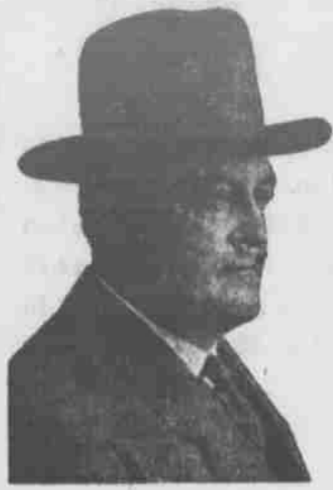
FOR COUNTY CLERK

Republican Candidate FOR SHERIFF OF Umatilla County.