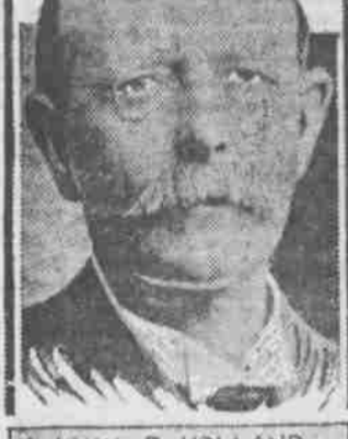
JOHN P. HOLLAND