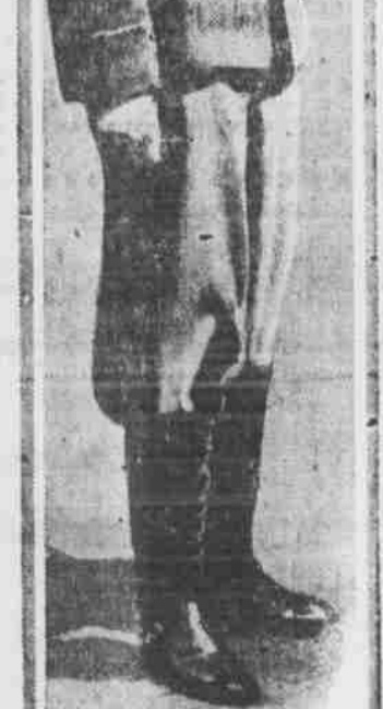
GRAND DUKE NICHOLAS, uncle of the Czar, is said to have left Trebizond in Turkey in Asia for Odessa from which point he will go to the Dobruja battle front to take command of the Russian forces battling against the Turks, and endeavor to push his way through to Constantinople from the north.

Catholic Church. First mass tomorrow at 6 o'clock; second mass at 8 o'clock; high mass at 10 o'clock. Sunday school at 2 p. m. Evening devotions at 7:30. The week-day mass will be a 7:30 a. m.