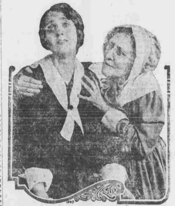
LOUISE HUFF, FAMOUS PLAYERS STAR IN PARAMOUNT PICTURES. No wonder Louise Huff can melt an entire audience by her tears! As the cello from the Famous Players-Paramount production "The Reward of Fidelity" the dainty little player really sheds bona fide tears, which not even Theodore Roosevelt could brand as a bit of nature-faking! In the role of a woman who has just learned the death of her father—hence the copious flow of brine.