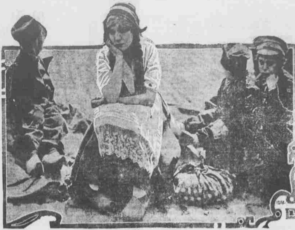
MARY PICKFORD IN "HULDA FROM HOLLAND," A PARAMOUNT PICTURE, PRODUCED BY FAMOUS PLAYERS.