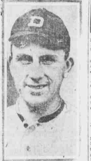
HARRY COVELESKI If, and all baseball stories about the leading teams in the American League now-a-days must be preceded with an (I), the Detroit Tigers get into the world's series. Harry Coveleski will do most of the pitching for the Juggernauts. Coveleski is far and away the best twirler on the Tigers' staff. So far this season he has won 22 games and lost 9.