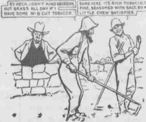
THE GOOD JUDGE HEARS THE GARDENERS' CONVERSATION.

IT MAKES a hard-working man glad to have a dime's worth of W-B CUT Chewing in his pocket. A small chew is going to keep him tobacco contented and happy a long time—and he saves himself the labor of grinding, spitting. It's rich tobacco and pays both ways: finer in flavor—more satisfying and it saves money.