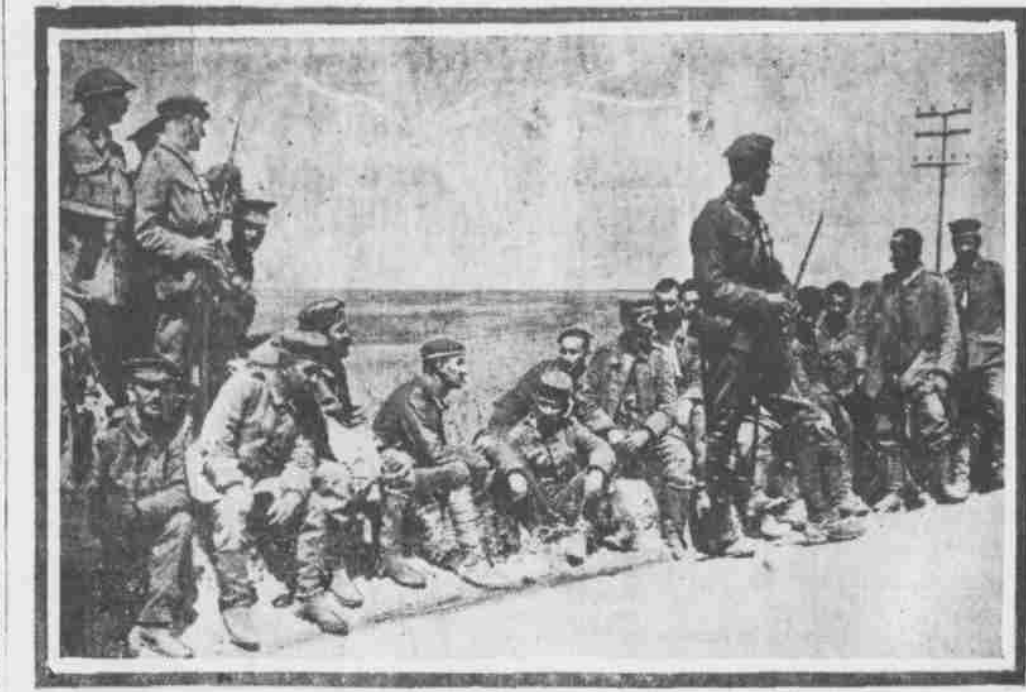
GERMAN PRISONERS. In this picture a group of German captives are shown on their way to the rear of the British lines. They are among the first prisoners taken in the famous Picardy drive.