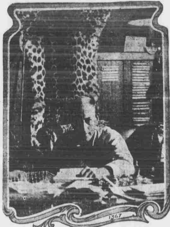
CECIL B. DE MILLE, DIRECTOR GENERAL OF THE JESSE L. LASKY FEATURE PLAY COMPANY, PRODUCERS FOR THE PARAMOUNT PROGRAM.

It is rare indeed that Cecil B. De Mille, director general of the Jesse L. Lasky Feature Play Company, producers for the Paramount Program, finds enough time away from his duties as director to have his photograph taken while sitting behind his desk. It was Mr. De Mille who taught Geraldine Farrar how to act before the motion picture camera, and he has also initiated other well known stars and artists such as Charlotte Walker, Mae Murray, Lou Tellegen, Edith Wynne Matheson, Rita Jolivet, Edgar Selwyn and many others.