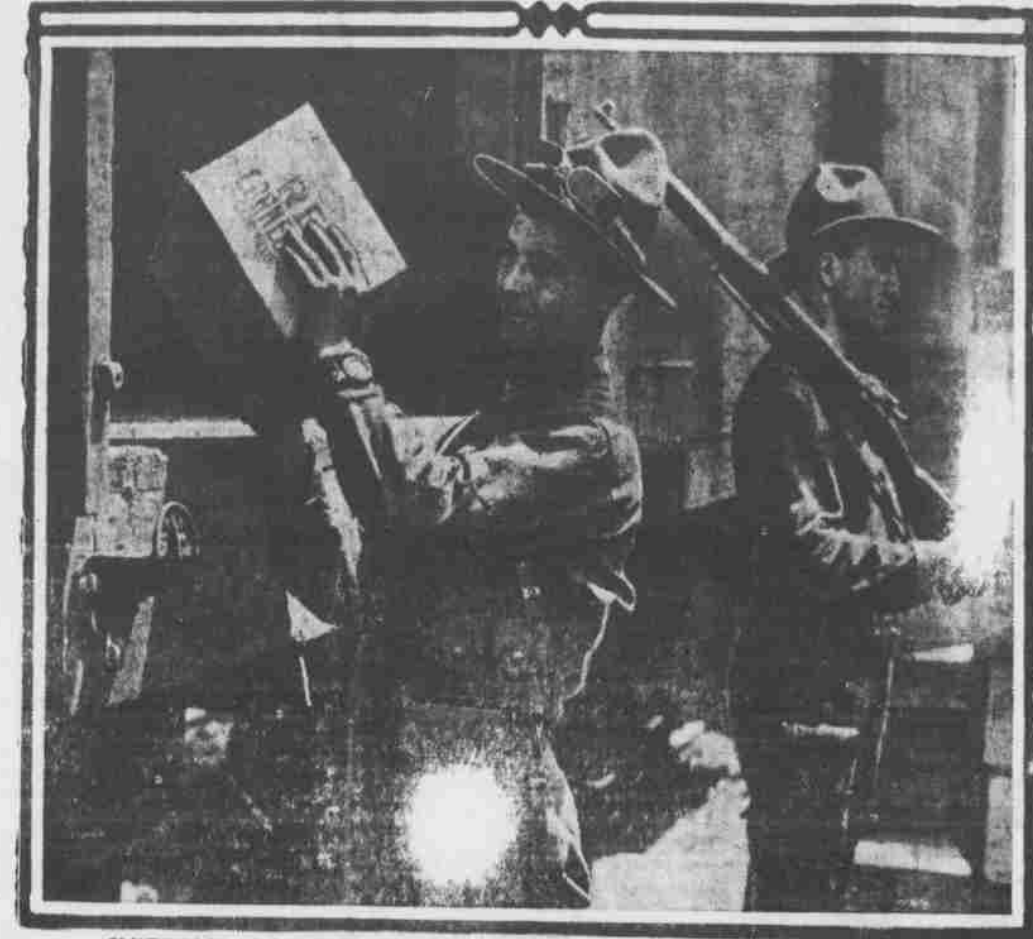
SHIPPING AMMUNITION TO BORDER