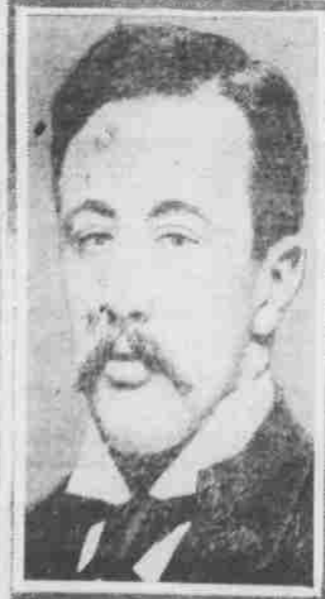
ABOVE—DUKE OF CONNAUGHT BELOW—DUKE OF DEVONSHIRE. According to dispatches from England the Duke of Connaught, uncle of King George and present governor-