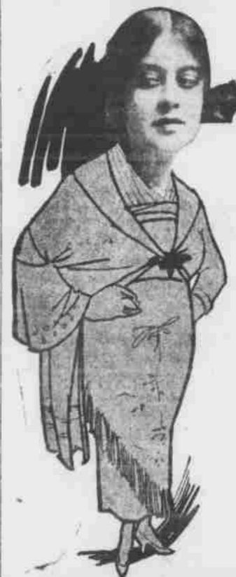
LENORE ULRICH "PAULA"

PORTLAND ROSE FESTIVAL, June 7-9. LOW FARES.