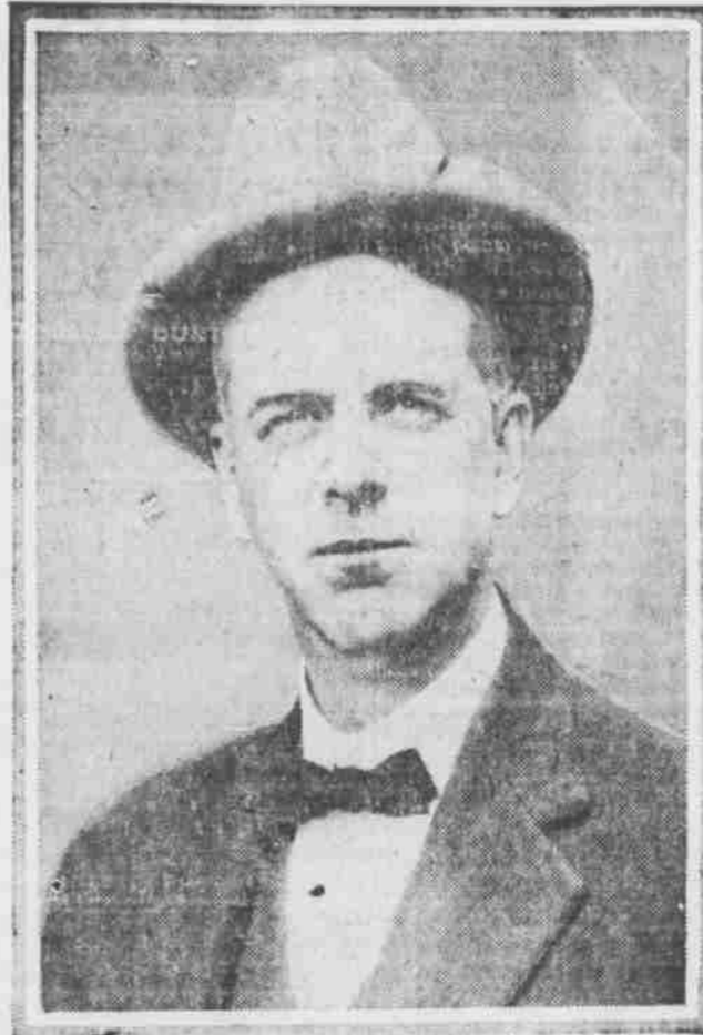
WILLIAM S. KENYON.

German Destroyer is Sunk. AMSTERDAM, via London, June 9.—The Telegraf says that a German destroyer struck a mine and went down off Zebrugge May 31. Parchment manuscripts nearly 800 years old, from which the ink has faded from view, have been read by a Berlin scientist who photographed them with ultra violet rays.