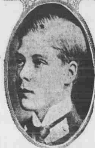
ABOVE—PRINCESS JOLANDE BELOW—PRINCE EDWARD