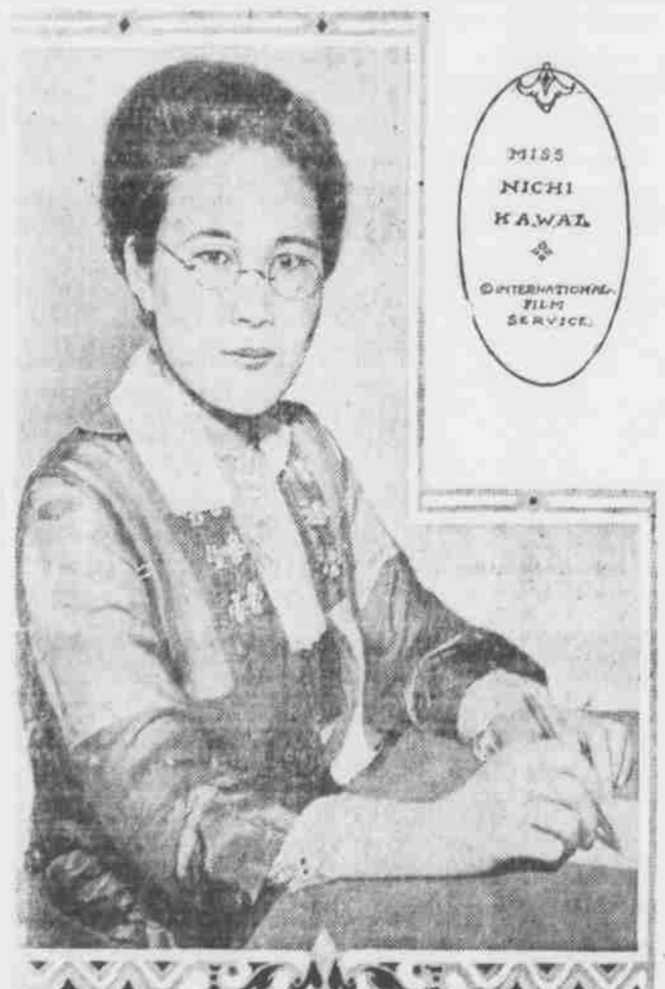
MISS NICHU KAWAZ INTERNATIONAL FILM SERVICE.

NEW YORK, June 2.—"The peace of the world will finally be brought about by the United States," says Miss Wewal, the only Japanese delegate to the 13th biennial convention of the Federation of Women's Clubs, now in session here.