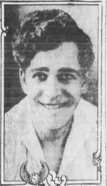
Crane Wilbur in "A Law Unto Himself" Pastime Tuesday-Wednesday.

NEW YORK, June 5.—A solemn mass of requiem for the Irishmen who fell in the recent revolt in Ireland or were executed for taking part in it was celebrated in All Saints church. Members of the Ancient Order of Hibernians attended.