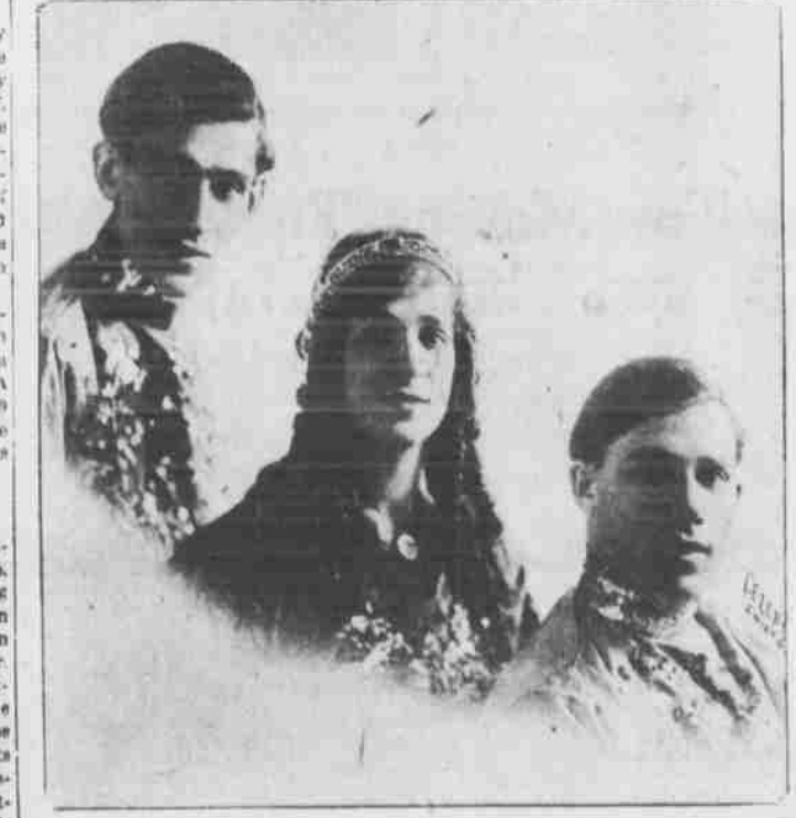
Troupe Trio, at the Alta Theater Today.