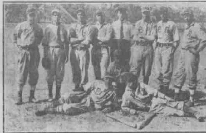
Pilot Rock Ball Team, Permanent Winners of the Blue Mountain League in 1915. Who Will Meet the Pendleton Bucks at Round-Up Park Tomorrow Afternoon.