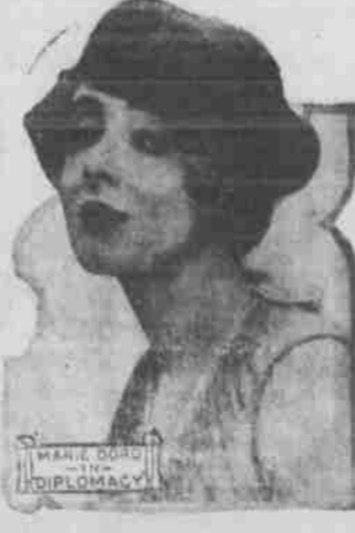
At the Alta Sunday and Monday.