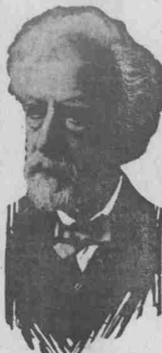
DR. ABRAHAM JACOBI