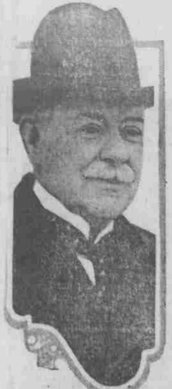
THOMAS NELSON PAGE.