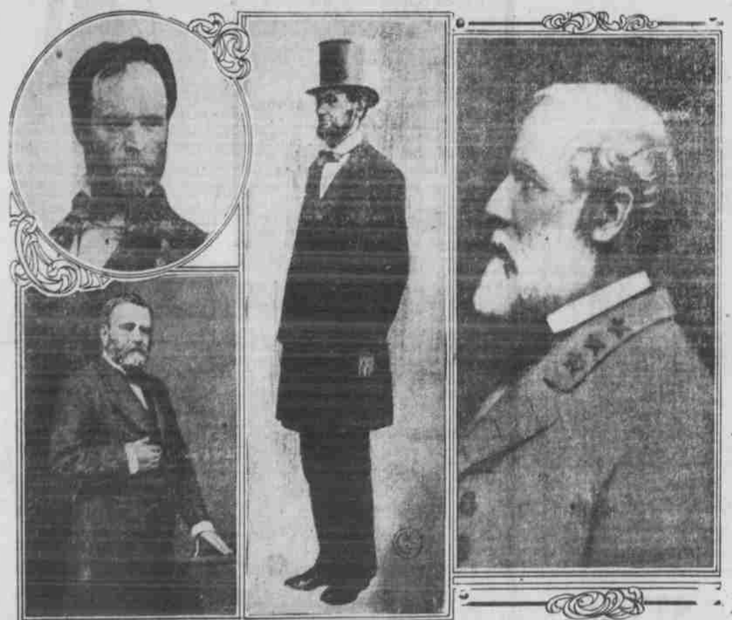
Four of the greatest characters in the American history, Abraham Lincoln, General Grant, General Sherman, and General Lee, as seen in "The Birth of a Nation," Oregon Theater, 3 days, starting Thursday, April 27th.

One of the most striking scenes of "The Birth of a Nation," coming to the Oregon, is the surrender of Lee at the historic McLean home in the vicinity of Appomattox courthouse.