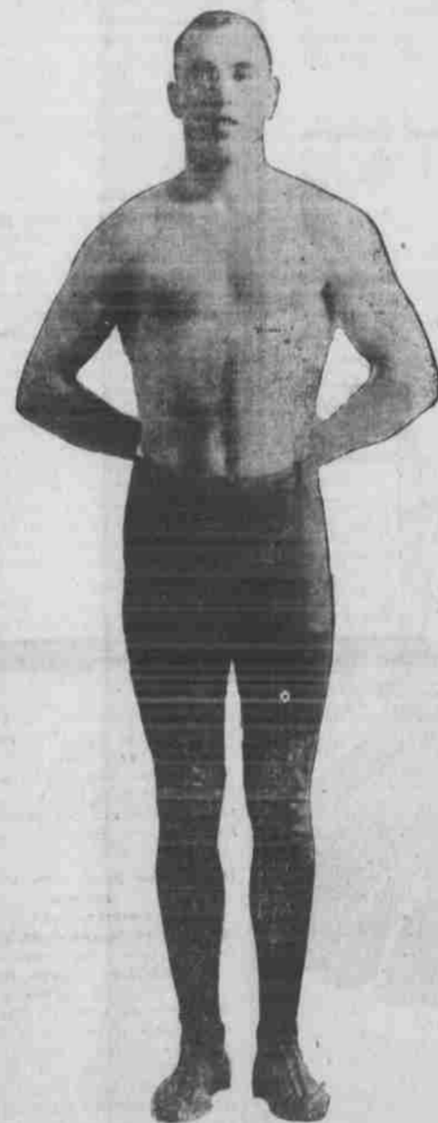
Ajax will meet McCarrill tonight at the Oregon theater in what promises to be an interesting wrestling match.