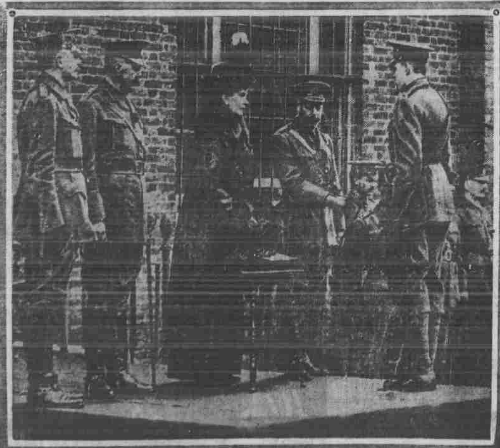
JOHN REDMOND, LORD KITCHENER, QUEEN MARY & KING GEORGE.

This, the latest picture of King George and Queen Mary, was made on March 17th, when the king and queen visited the Irish Guards at Wo dley and presented the soldiers with shamrocks. King George has just commanded the Keeper of the Privy Purse to turn over $500,000 of his private fortune to the British treasury to be used in conducting the war.