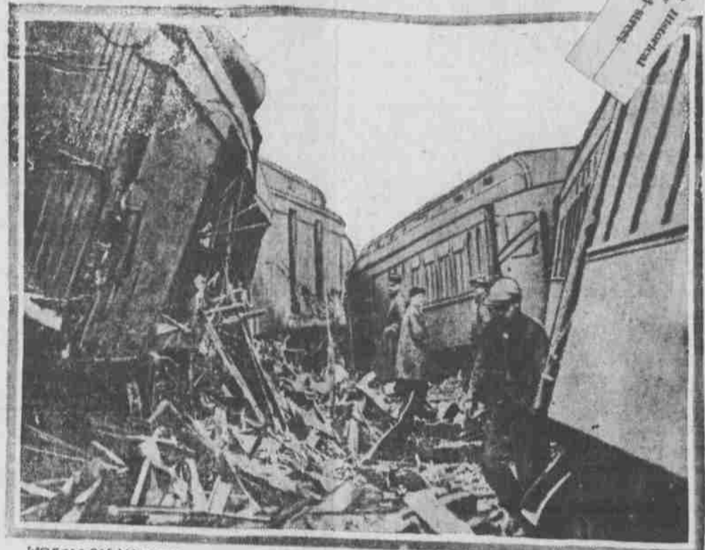
WRECK ON NEW YORK CENTRAL AT AMHERST, O. Here is shown the wreckage of the three fast fliers on the New York Central, reduced to a mass of wreckage in the crash which occurred at Amherst, O., thirty seven miles west of Cleveland. Between twenty five and thirty lives were lost in the wreck. Forty persons were injured. The second section of the eastbound Chicago-Pittsburg limited crashed into the first section of the westbound Twentieth Century limited ploughed into the wreckage which had bulged out over a parallel track.