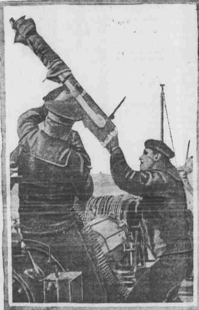
BRITISH ANTI-AIR CRAFT NAVAL GUN.

Anti-air craft guns mounted on the decks of the allied war vessels anchored in the harbor of Salonica are always ready to be trained on the enemy's flying craft. The photo shows one of the guns ready to wing a daring air scout who might be willing to take a chance to get the "lay of the country."