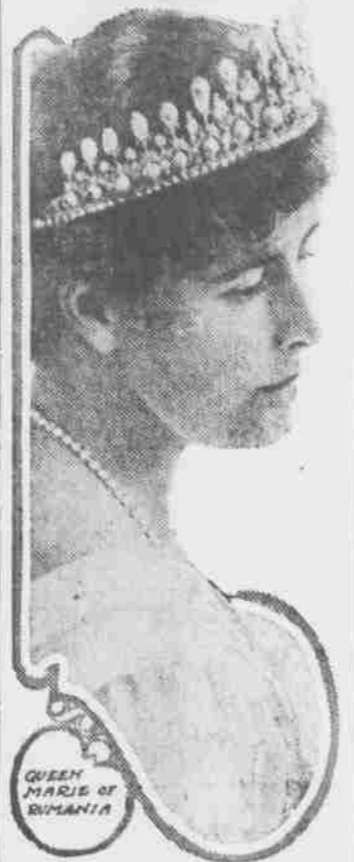
BUCHAREST, March 23.—Queen Marie of Rumania is seriously ill. Court physicians state her condition is growing worse.