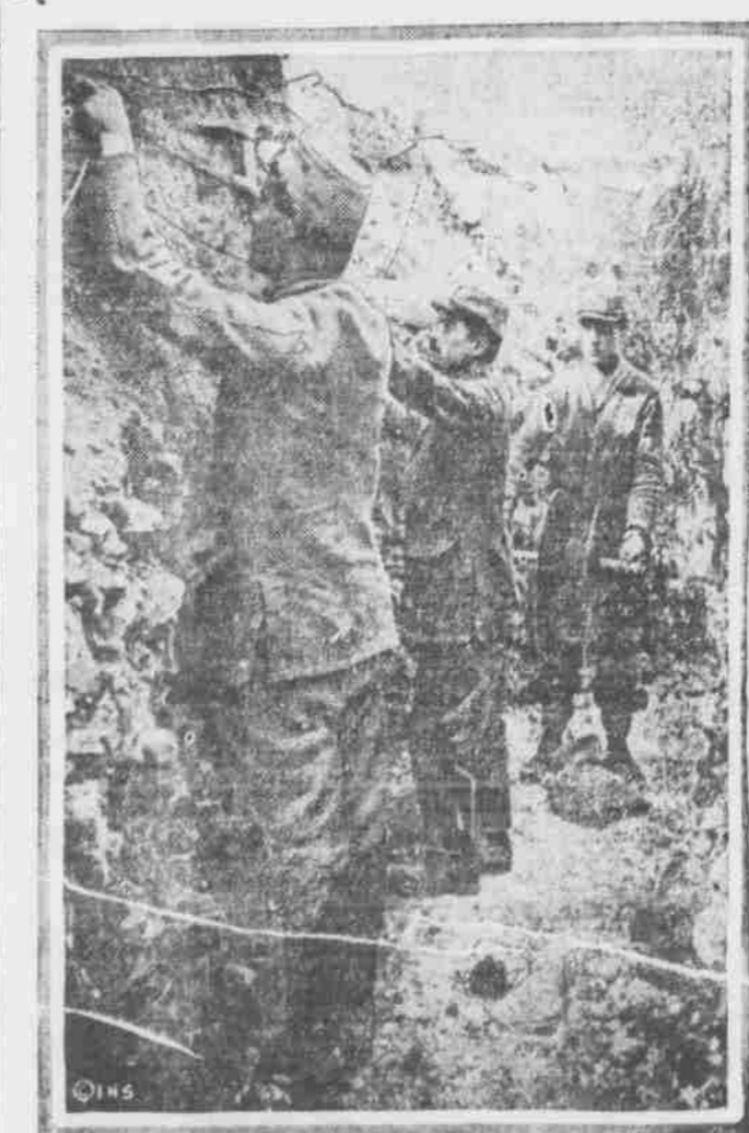
The picture shows members of the French engineering corps stringing telegraph wires through the trenches in the Argonne. When a position is changed and new trenches occupied, new lines of wire are immediately put in so that no time may be lost in the communication system.