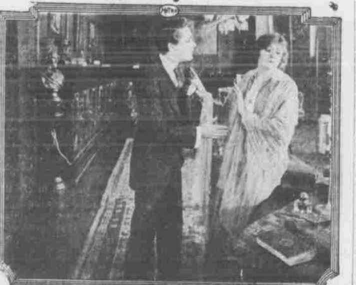
SCENE FROM THE TURNOUT. Alfa Theater Today & Tomorrow.

Finance Minister White, in announcing the new credit to parliament, stated that as a result the British authorities already had called upon the Canadian munitions board to place in Canada new orders for munitions to the amount of $20,000,000. He intimated that other orders would be received soon.