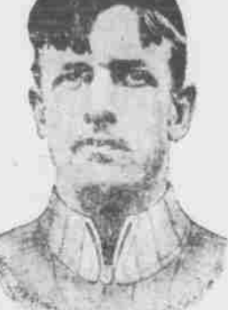
CHRISTY MATHEWSON Famous Baseball Pitcher, says:

Tuxedo develops more joy-power to the pipeful than any other tobacco—why? Because it's the only tobacco made that will not "bite"—nor even try to "bite"—the most sensitive tongue and throat.