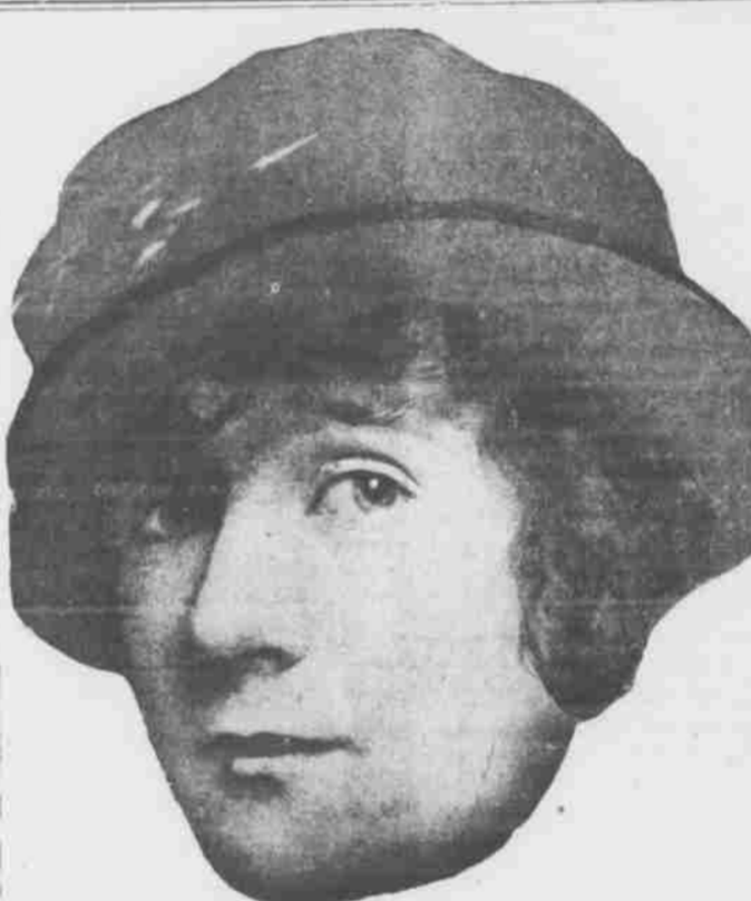
Mae Marsh in "The Escape," at Alta Tomorrow and Wednesday.

For sale—Tent house, 307 Willow. Found—Gold earring. May have same by calling at this office and paying charges. Wanted—Second hand traveling bag. Must be in good shape and cheap. Inquire "A" this office. Lost—Ladies small black purse, containing money. Finder please return to this office and receive reward.