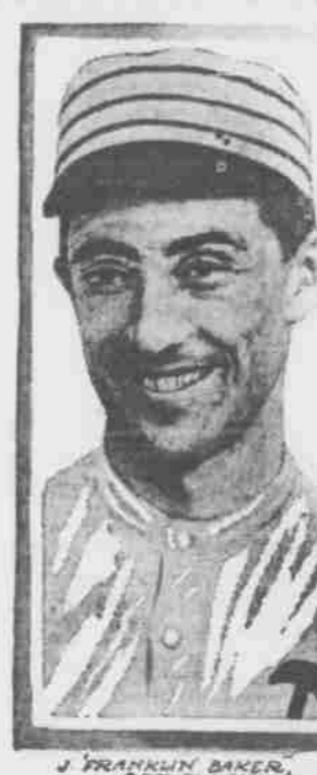
J. FRANKLIN BAKER