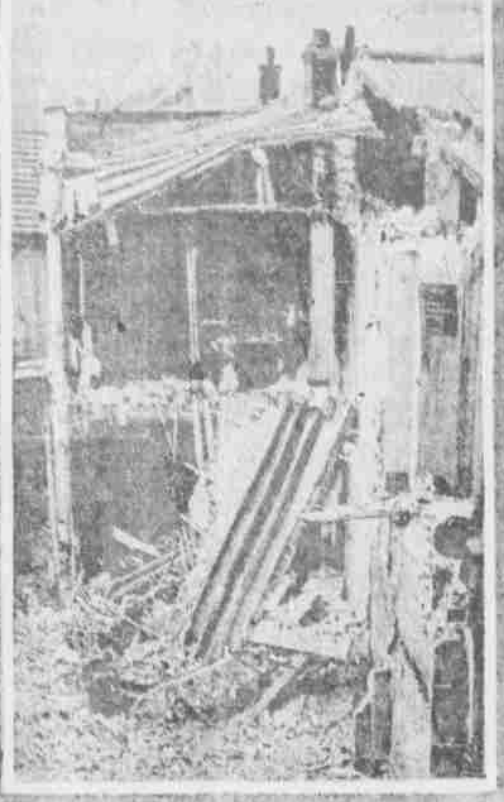
What a Bomb Did to the Subway