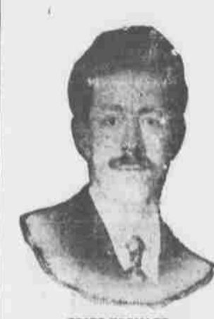
FRITZ KREISLER World-famous Violinist

—when you want a real smoke, get behind a pipeful of Tuxedo and watch all the big and little Worries that have been a-besieging you, evacuate their trenches and make a rushin' advance to the rear. Those fragrant whiffs of "Tux" make them feel too joyful—no self-respecting Worries can stand for that.