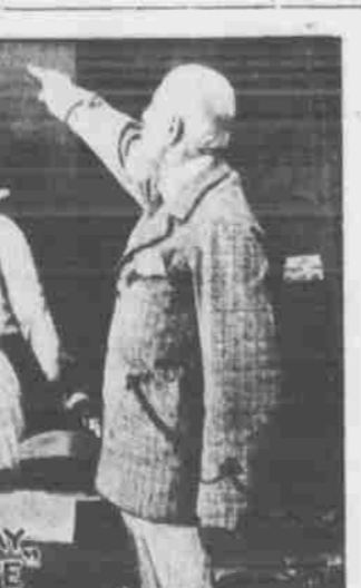
SCENE FROM THE SELIG REEL PLAY, "NO GREATER LOVE"