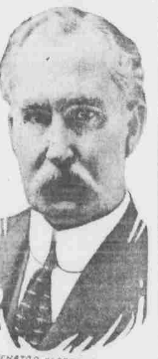
SENATOR ALBERT B. FALL

McCOOK & BENTLEY Pendleton, Oregon. Dealers in FARM MACHINERY and VEHICLES