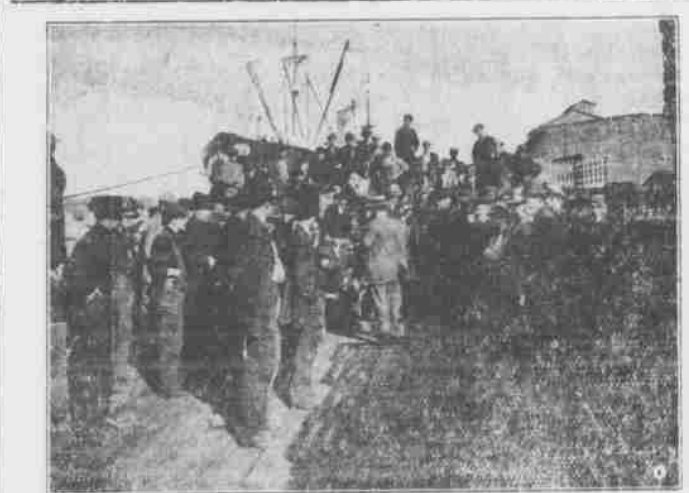
A volunteer lecturer of the Oregon Social Hygiene Society, speaking to employees of the American Can Company on the water front in Portland. The talk was given at mid-afternoon on company time.