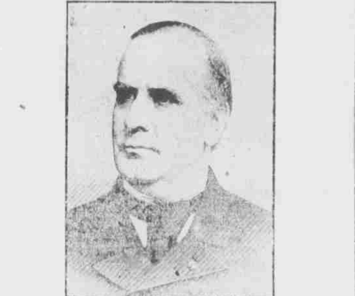
Ex-President Wm. McKinley, the man who had faith in Al Jennings. Alta Theater Today and Tomorrow.