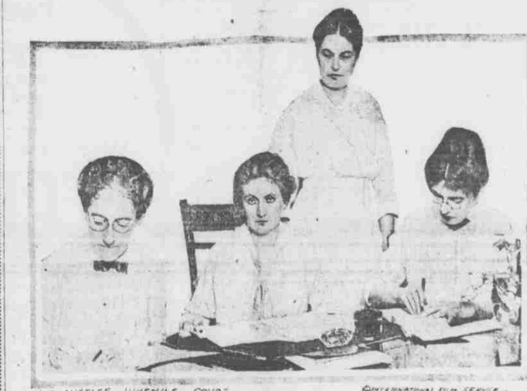
LOS ANGELES JUVENILE COURT.