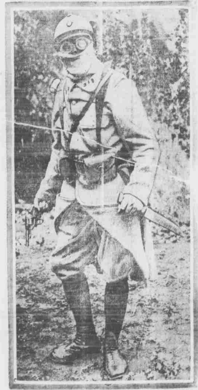
FRENCH "BLUE DEVIL"

By the queer costumes some of the French infantrymen at the front have earned the sobriquet of "Blue Devils" in their uniforms. The German command they are met by during their attacks and retreats are equipping themselves instead in steel helmets, goggles, anti-gas masks, revolvers and formidable knives. As a result the modern French soldier presents anything but an inviting picture and resembles a movie highwayman.