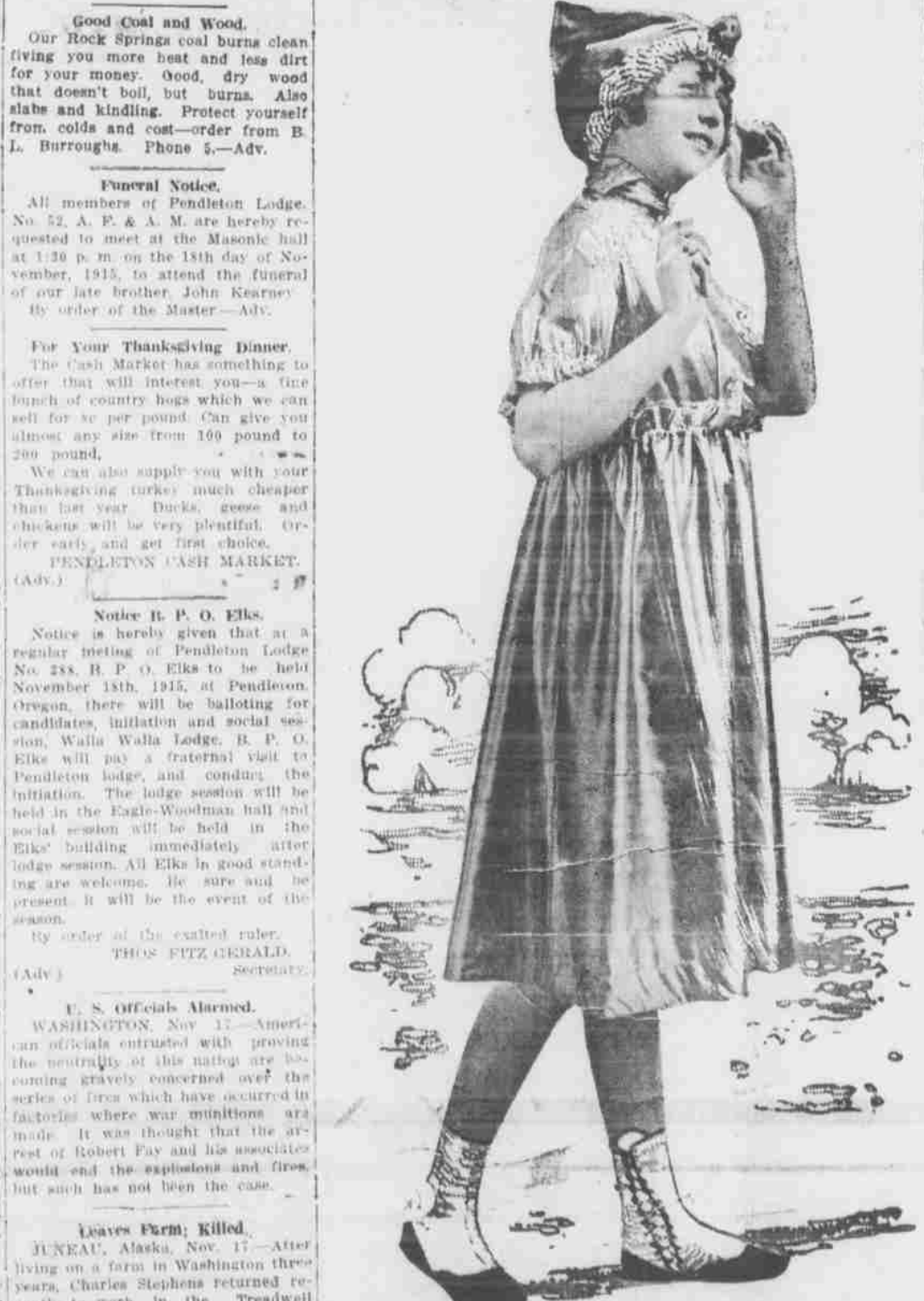
As you must look on Florida sands,

will be down there by the thousands some at Palm Beach unlike a lo